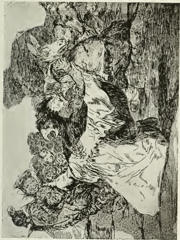
THE OLD DANCE OF CHARLATANS AND BEASTS